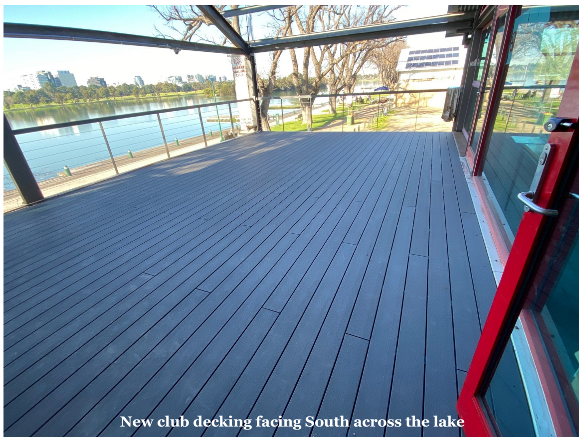
New club decking facing South across the lake

In late June we engaged a contractor to replace the aged wooden decking and bearers of the aged decking on the first floor of our clubrooms. A synthetic composite decking has been used, which requires minimal maintenance and is ecologically more sound. The result looks good and is a big improvement on what we had.